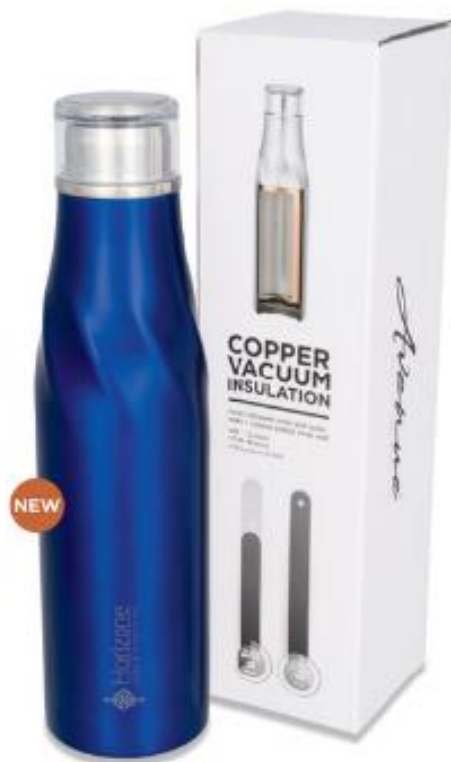
650 ML SEAL-LID COPPER VACUUM INSUL. BOTTLE