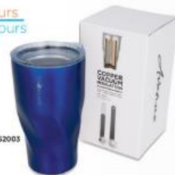
420 ML INSULATED TUMBLER