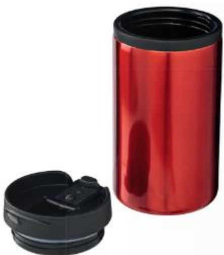
300 ML INSULATED TUMBLER